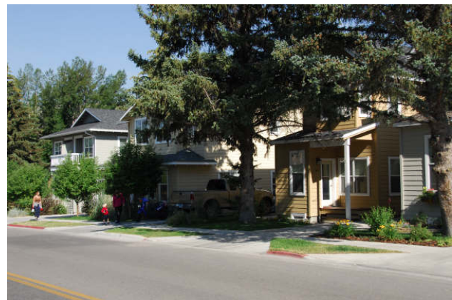
Twelve Pine Townhomes, East Kelly Avenue

The periphery of this district also acts as the interface between the National Forest and the town. All future development including improvements to existing properties will need to be sensitive to this issue and provide wildlife permeability.