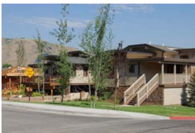
Cache Creek Drive