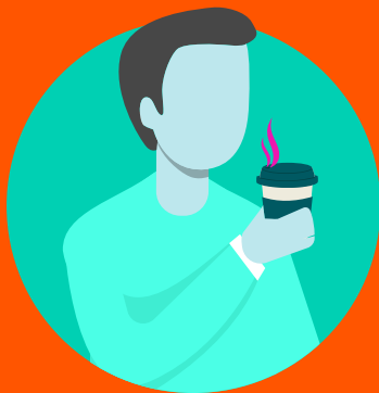
Loss of sense of smell or taste