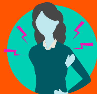
Muscle aches and pains